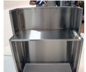
3. Insert top shelf (optional: insert sink or ice bin)