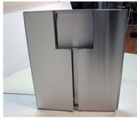
1. Remove security lock pins

DELUX Portable Bars can be disassembled and reassembled in one minute, without tools, allowing for a 70% space saving in storage and/or transportation. It can be carried through smaller doors, narrow hallways, on rooftops and in most standard cars.