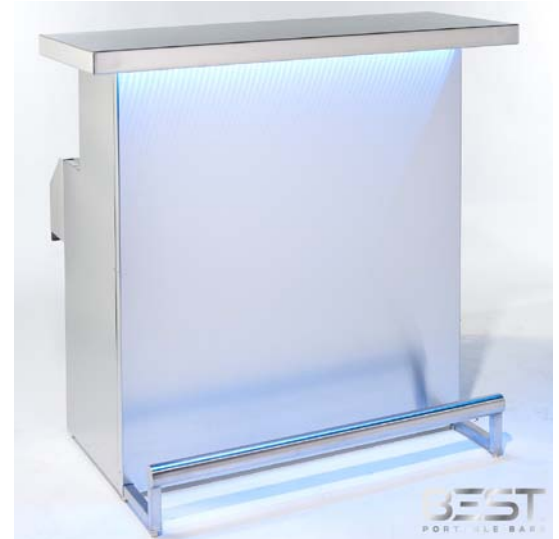
Integrated Holographic RGB Lighting