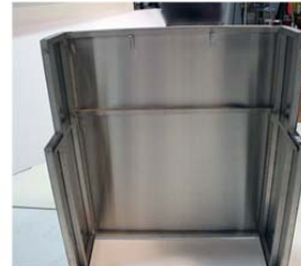
2. Open both sides of the bar