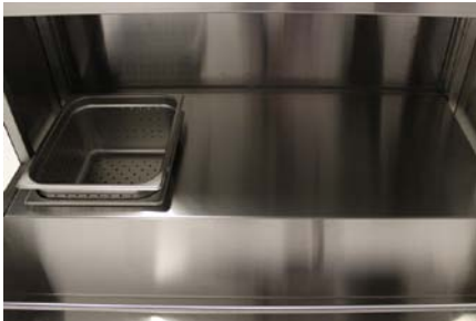
Integrated Waterfree Ice Bin