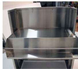
4. Insert speed rail