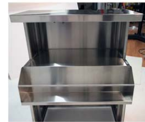
5. Install bar top (optional: plug in lighting power supply)